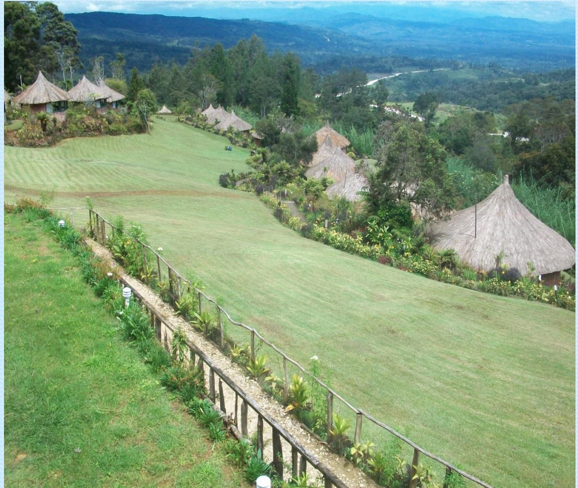
Ambua Lodge -Tari