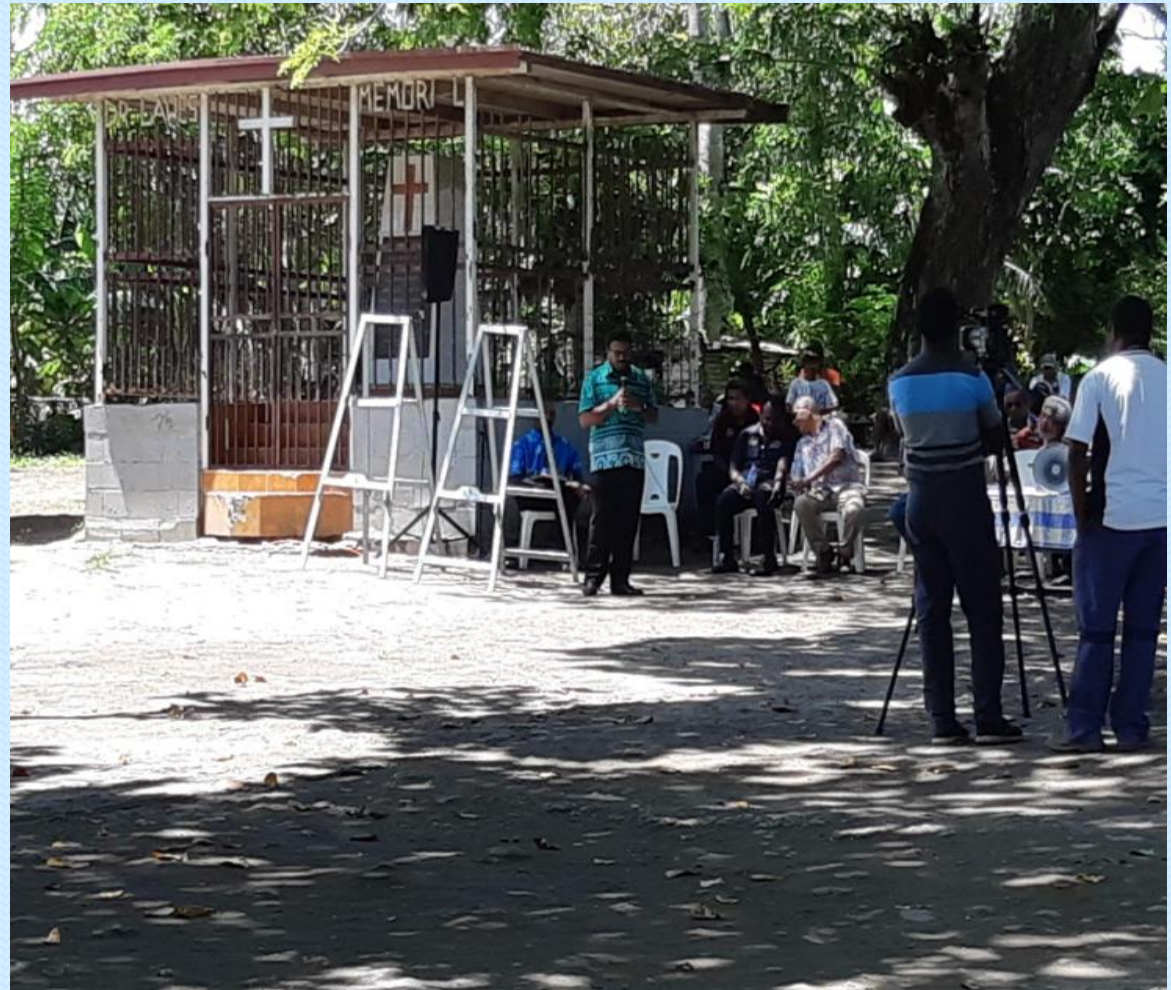
2019 Court User Forum at Hula Village - Central Province