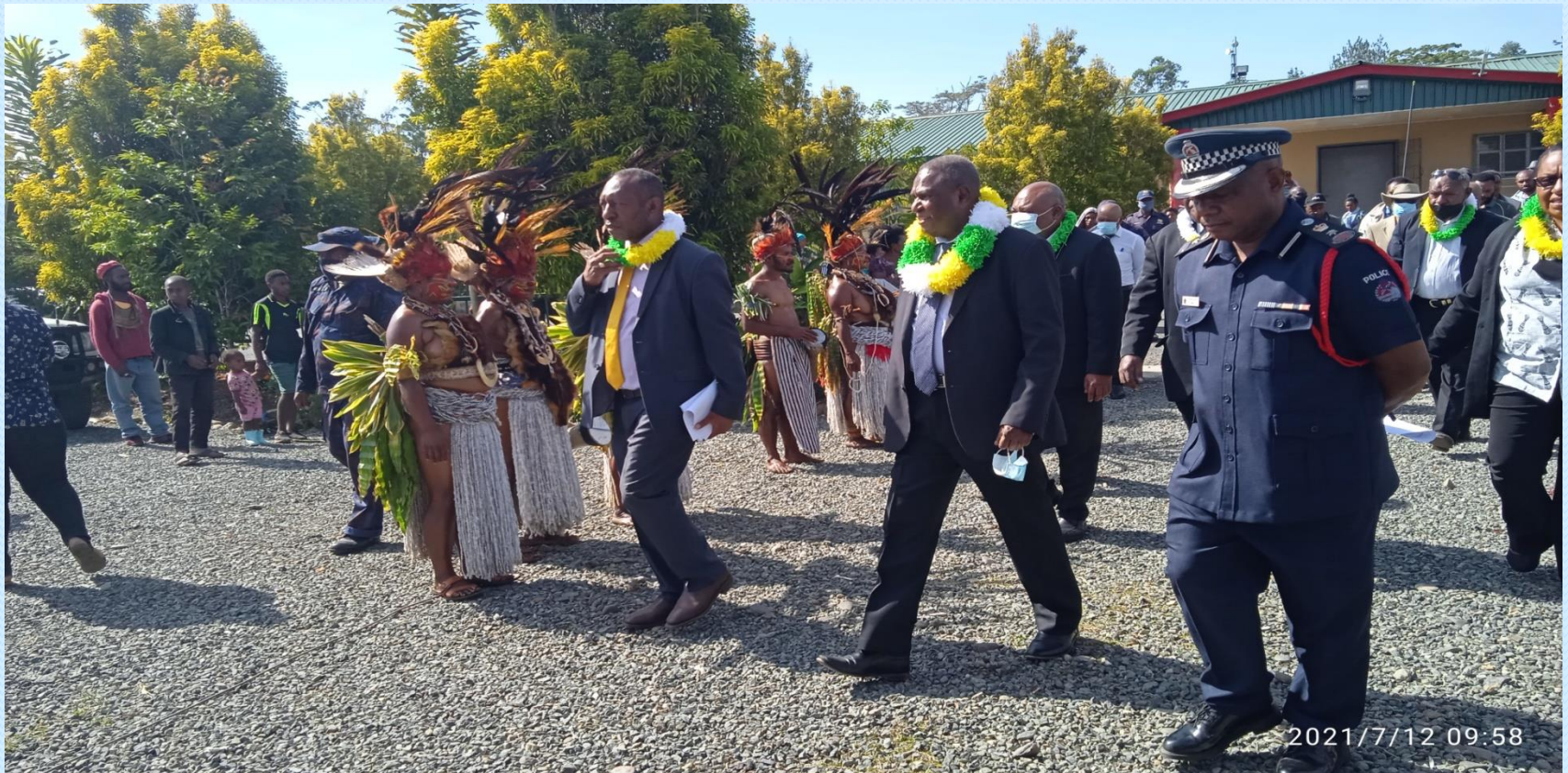
Chief Justice circuit to Minj - Jiwaka Province July 2021