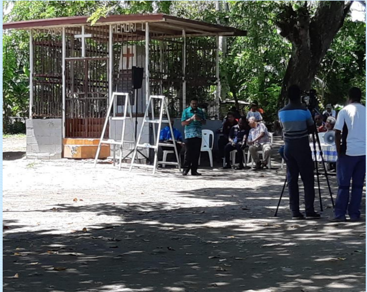
2019 Court User Forum at Hula Village - Central Province