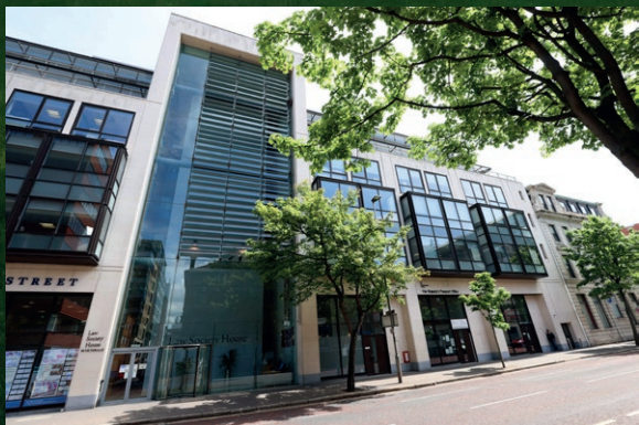
Law Society House, Belfast