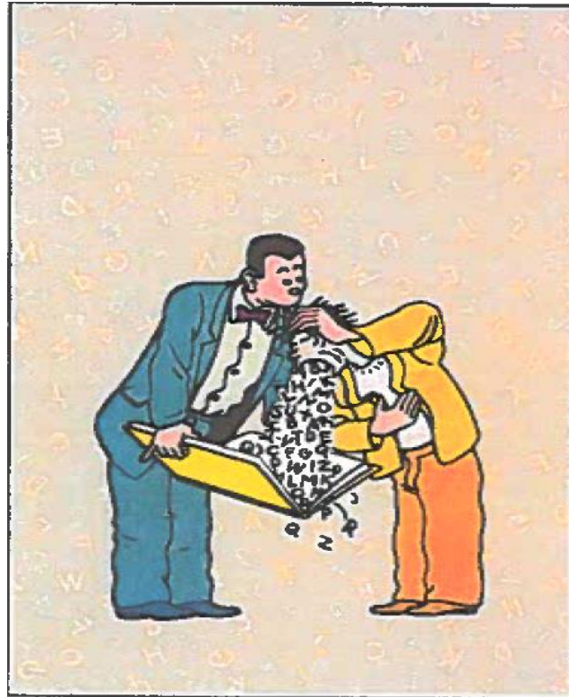
The role of Legislative Counsel