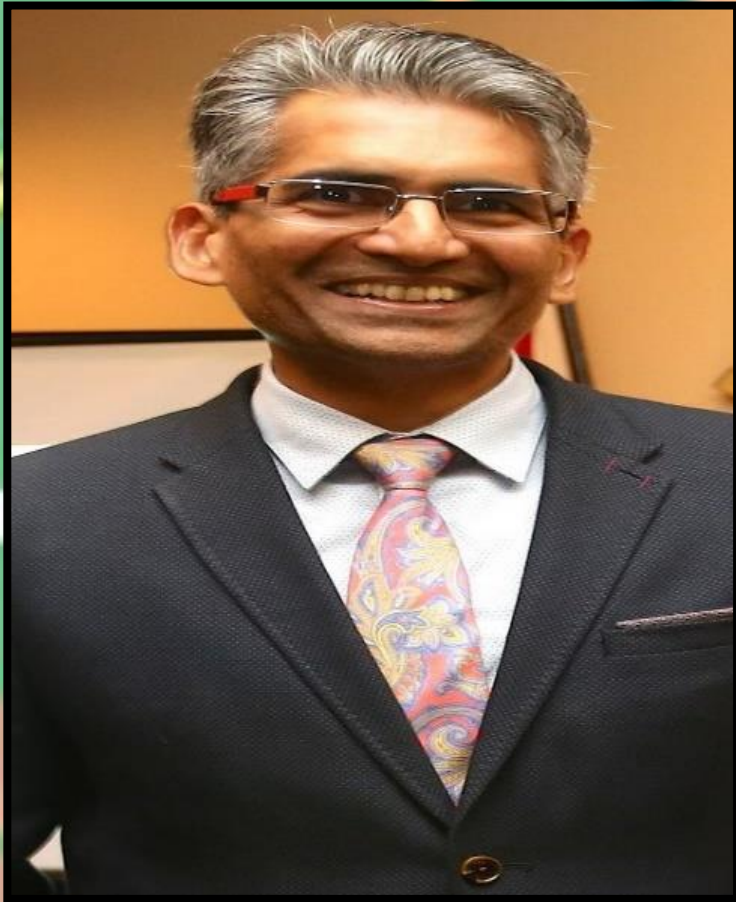
Justice Vasheist Kokaram, Supreme Court, Trinidad, Mediation Exponent