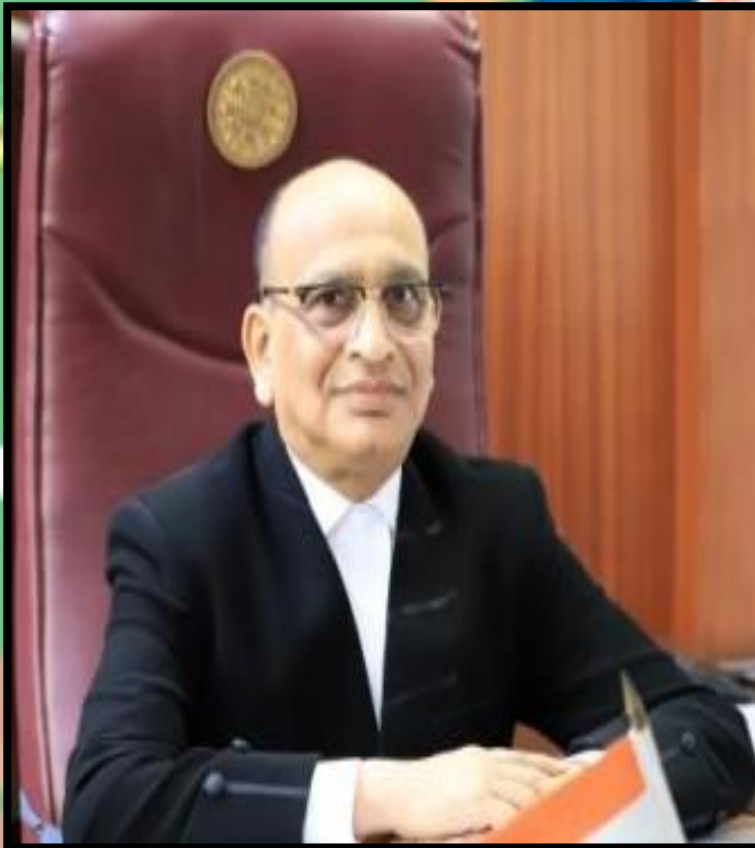
Hon'ble Mr. Justice Sudhir Jain, Judge, High Court of Delhi.