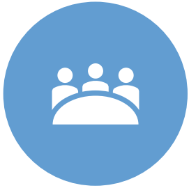
COMMITTEE OF EXPERTS