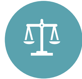
WORKSHOP IN STELLENBOSCH IN THE MARGINS OF THE INTERNATIONAL MILITARY JUSTICE FORUM