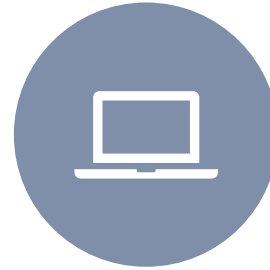
MULTIPLE ONLINE MEETINGS